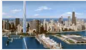
The Chicago Spire to become world's tallest residential building