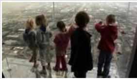
Sears Tower adds glass 'walk out' 1350 feet high