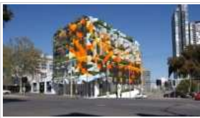
Pixel building aims to be world's first carbon neutral office development