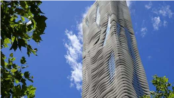
The Aqua tower in Chicago