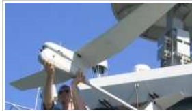
AeroVironment Aqua Puma UAV completes Royal Australian Navy Sea trials