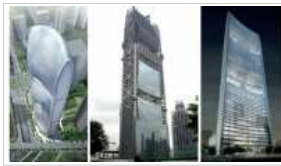
One of the world's greenest skyscrapers approaches completion