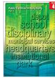
Public Facilities in Hong Kong Part 2