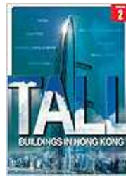
Tall Buildings in Hong Kong