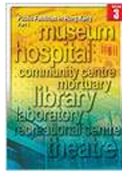
Public Facilities in Hong Kong Part 1